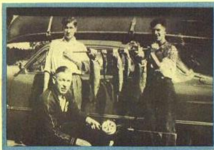
Caught right in Bigbob Lake

If you plan an outing, fishing or a picnic, we will be happy to pack a lunch for you if we are advised the previous day.